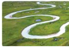
The upper course